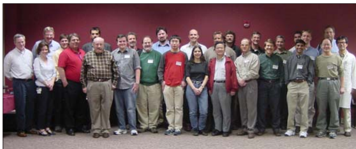
Attendees of the 2 nd SER-CAT Symposium

The symposium title was "Synchrotrons and Structural Biology". It was designed to bring the scientists who made the beamlines together with scientists who are users of the beamlines, to provide a two-way forum for the enhancement of capabilities and productivity at the SER-CAT sector. It was also intended to encourage mutual understanding, support, and collaboration within the organization. In that spirit, 50 attendees converged on the University of Alabama campus on a beautiful spring day to hear 11 speakers. The morning session was devoted primarily to beamline topics, and the afternoon dealt more with structural biology resulting from synchrotron data.