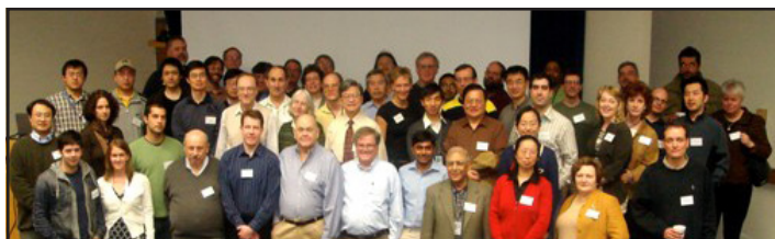
Group photo of 2007 Symposium attendees at NCI in Frederick, Maryland